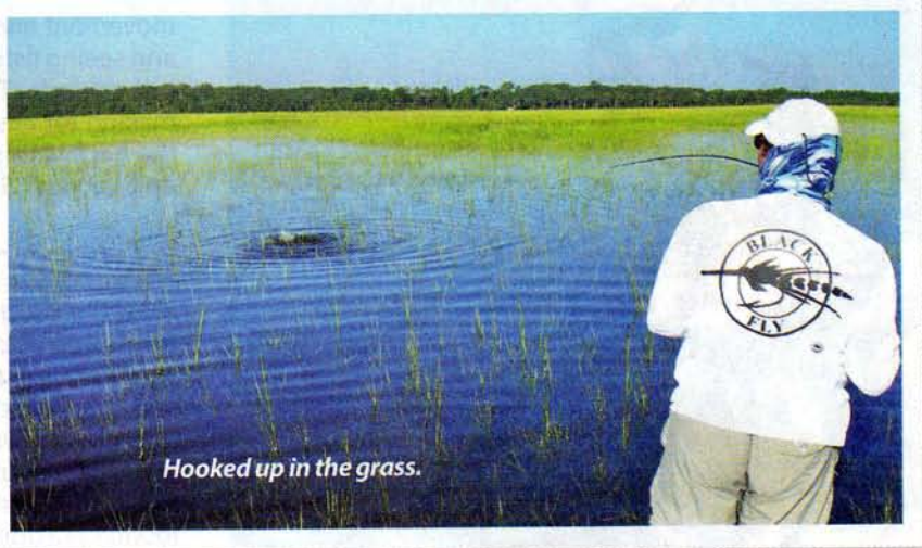
Hooked up in the grass.

The atmosphere is "wild". While fishing, you often hear the snapping pop sounds of exposed oyster bars 'breathing' through the air and then the alarming squawk of a marsh hen in the cord grass. It's often like being on a safari. You throw a blind cast in one direction into a deep